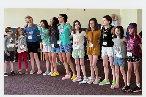
Music, Singing, & Friends!