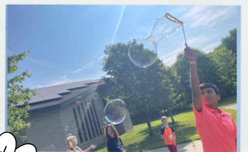
Nature, Bubbles & Outdoor Fun!