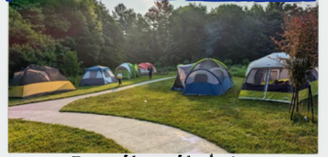
Family pitch In & Camp out